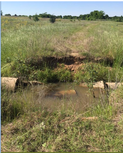
Pictured above: Bridge Washed Out by Hurrican Harvey floods.