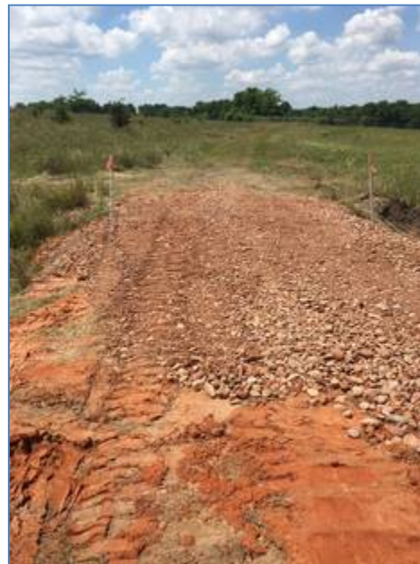
Pictured Above: Friedens Bridge Misistry to the rescueand repaied road.