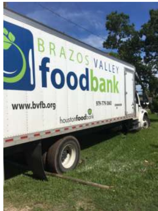
Food Bank truck at Navasota Pantry.