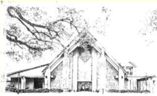
Friedens Church of Washington est.1890