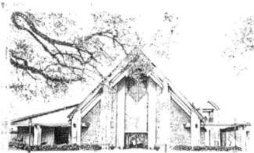
1890 Friedens Church of Washington 2021